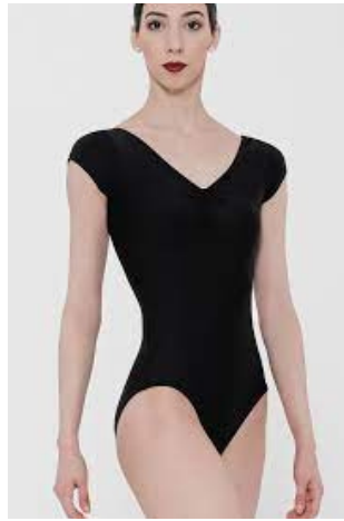
Wear Moi Candide Leotard in Level 7 & 8 Black