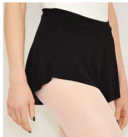
Level 6: Black Bullet Pointe Skirt No Chiffon Skirts

Leotard -- Black Wear Moi Faustine Camisole Leotard or Black Wear Moi Candide Short Sleeve Leotard and Flesh toned over/under camisole