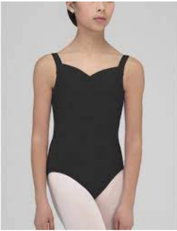
Wear Moi Faustine Leotard in Level 7 & 8 Black