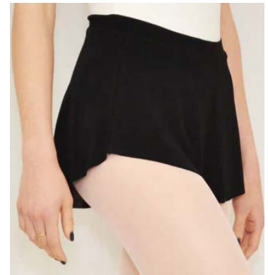
Black Bullet Pointe Skirt No Chiffon Skirts

Leotard -- Black Wear Moi Faustine Camisole Leotard or Black Wear Moi Candide Short Sleeve Leotard and Flesh toned over/under camisole